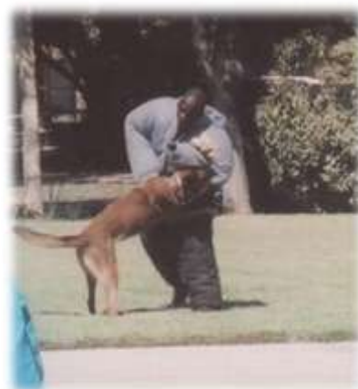
These photos were provided by JoAnn and show the different areas that STKC offered, along with some of the other K9 events that occurred.