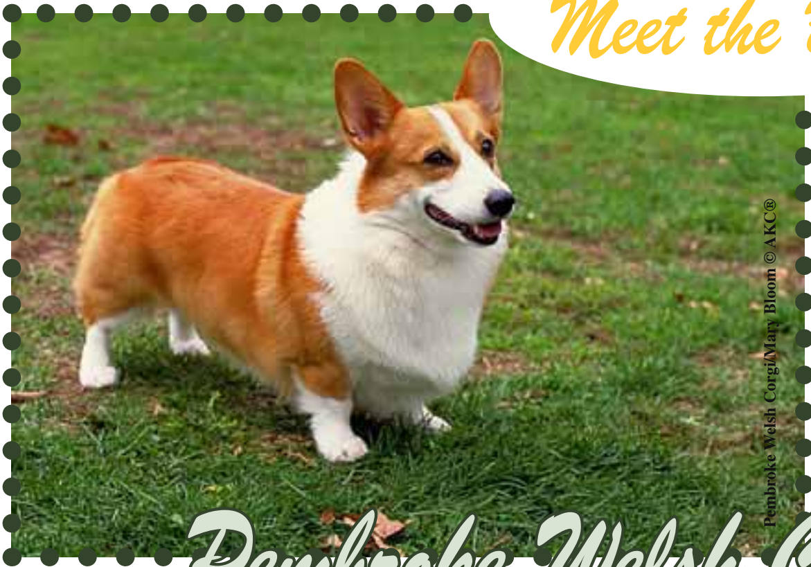
Pembroke Welsh Corgi