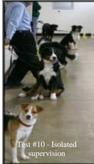
Test #10 - Isolated supervision