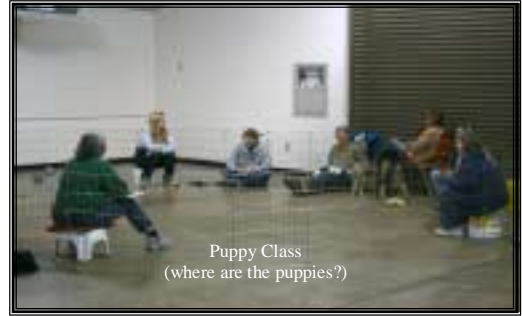
Puppy Class (where are the puppies?)

Here are a few photos from that fun event: