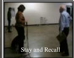
Stay and Recall