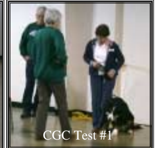
CGC Test #1